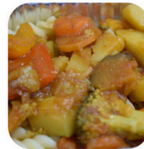
PASTA WITH VEG