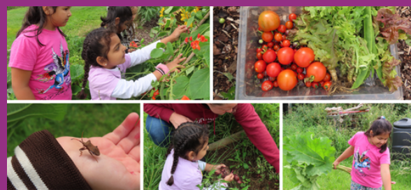
SUMMER WEEK 4 - ALLOTMENT ACTIVITIES