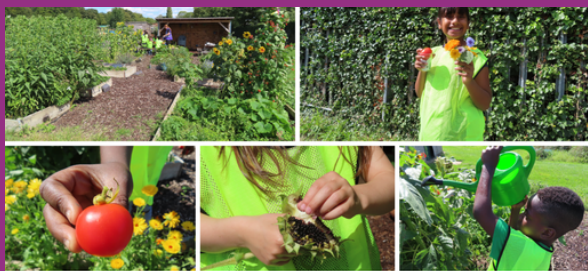
SUMMER WEEK 3 - ALLOTMENT ACTIVITIES