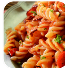
PASTA, CHICKEN & VEG