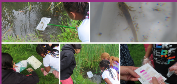
SUMMER WEEK 2 - POND DIPPING & WATER TESTING